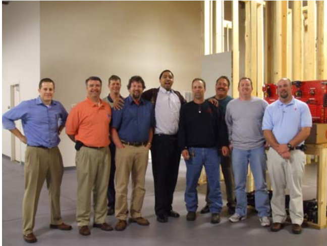
Come on!!! Three Plumbers????