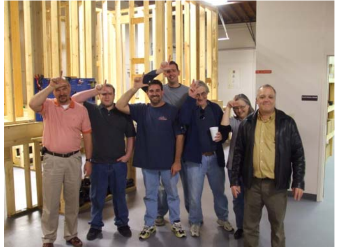
Looking pretty happy for losers!

the winning team did have three professional plumbers on it! I must say - not only did the winning house not have any leaks, it looked good!