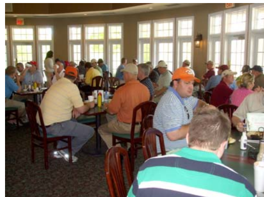
Good food and good stories